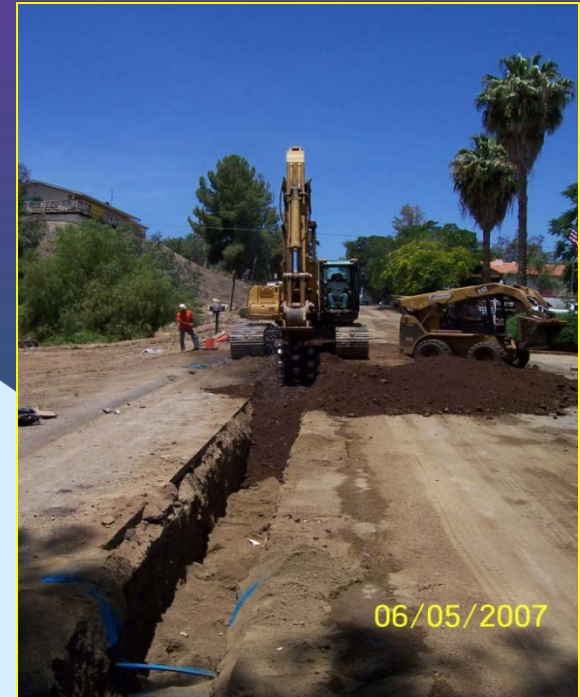
Example of Typical Pipeline Construction